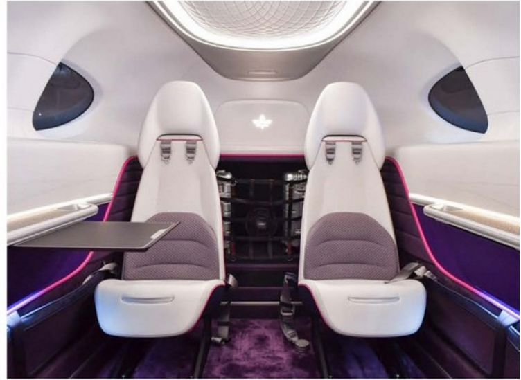
Our Pioneer Edition cabin, shortlisted for the industry's Crystal Cabin award, was unveiled at EBACE on 23 May and attracted large crowds of aviation enthusiasts, potential customers, and journalists.