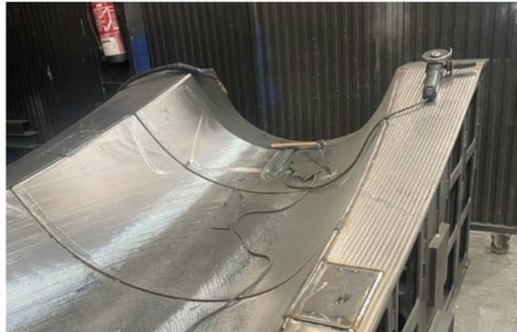
Layup mold for the bottom skin of the Lilium Jet fuselage. In order to manufacture the lightweight skin of the aircraft, composite material is laid up over the mold before being cured.