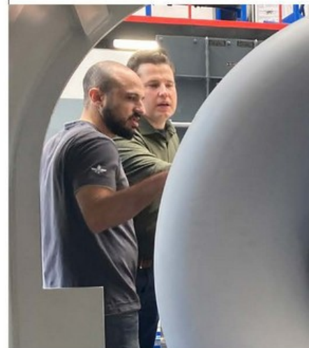
Equipment at Jetpel facilities in RWTH Aachen University, Germany testing Lilium's prototype engine.

The Lilium Jet e-motor is designed to deliver industry-leading power density, extracting 100kW of power from a system weighing just over 4kg