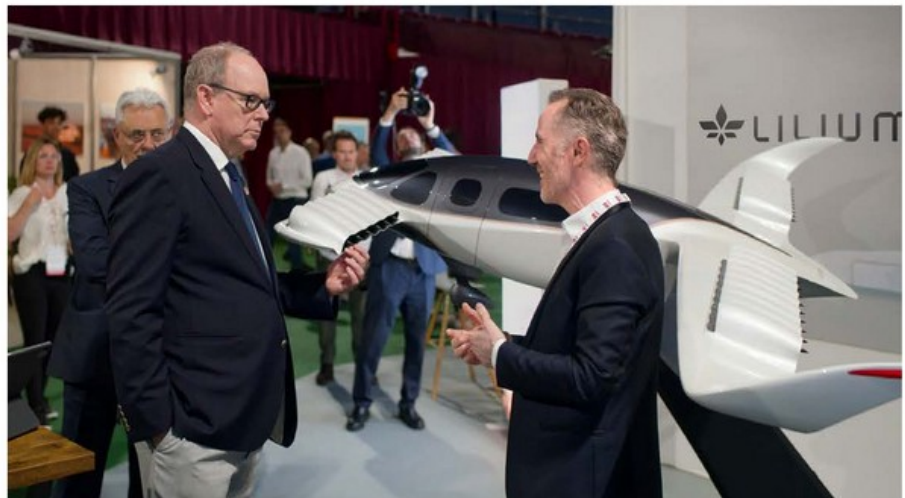
H.S.H. Prince Albert of Monaco was one of several illustrious visitors to the Lilium exhibit at the EVER conference in Monaco this May.

To support its private customer sales campaigns Lilium attended and will attend the following key events over the summer: EVER conference in Monaco (May 11-12); the European Business Aviation Convention & Exhibition (EBACE) in Geneva, Switzerland (May 23-25); Royal Ascot, UK (June 20-24); and the Goodwood Festival of Speed, Goodwood, UK (July 13-16).