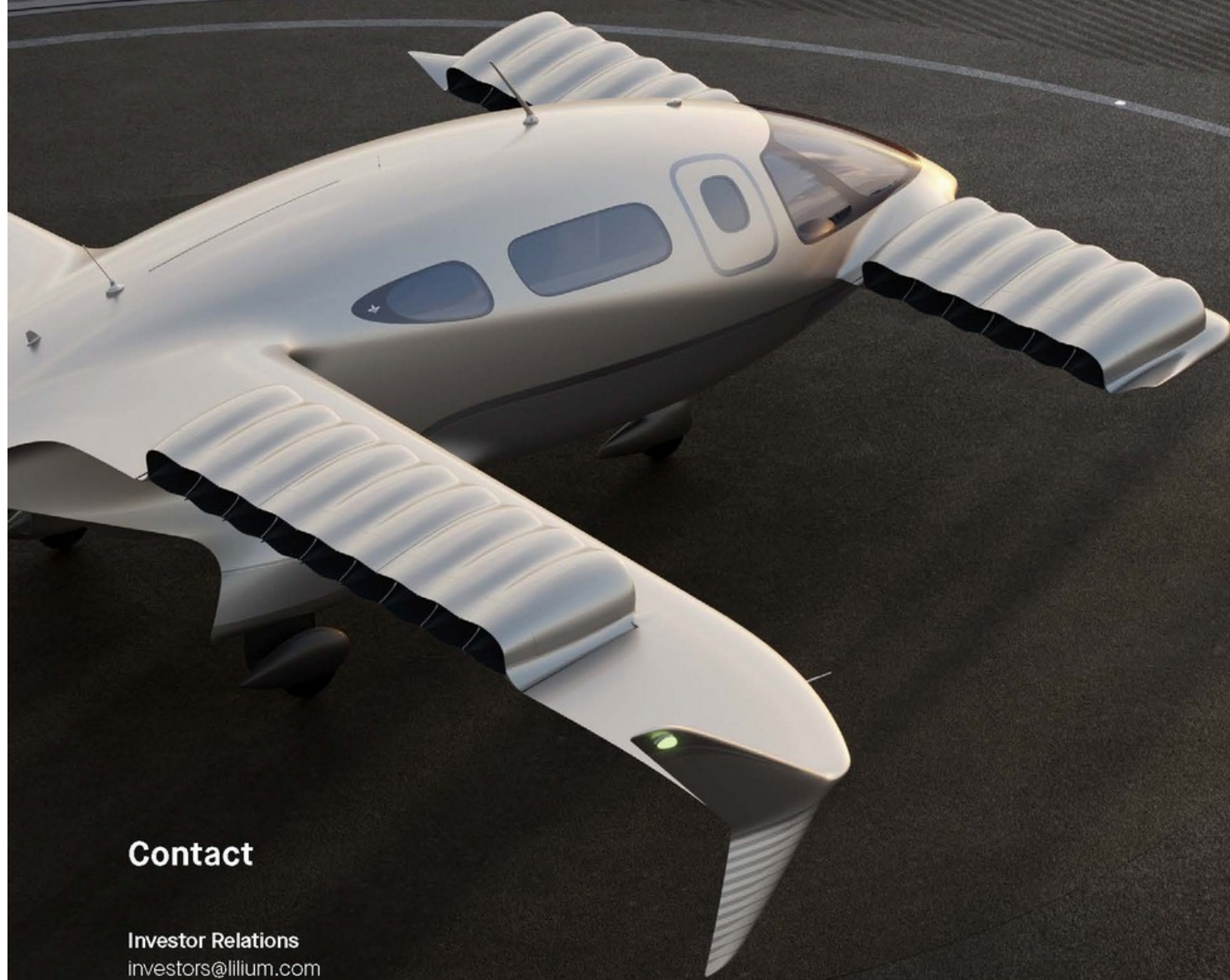
Rendered utilizing computer graphics