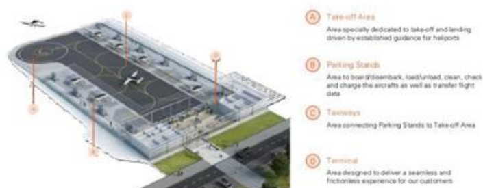
Lilium vertiports are based on a modular design and consist of four modules

In our standard vertiport configuration, as indicated in the example graphic above, our vertiports are intended to include end-to-end charging posts at each parking bay. Our charging infrastructure on a pad with 7 parking positions will be designed to accommodate up to a total of 20 charging sessions per hour, with 5 – 30 minute sessions per charge.