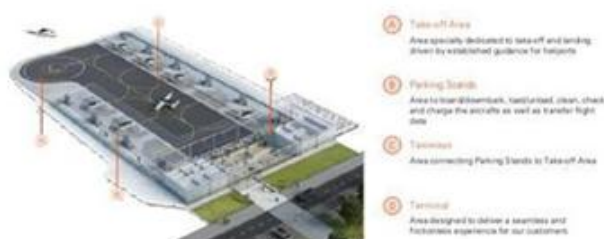
Lilium vertiports are based on a modular design and consist of four modules

Our Vertiports are intended to include end-to-end charging posts at each parking bay. At entry into service, we expect charging sessions of 15 to 45 minutes will be facilitated. At later stages, we plan for our charging infrastructure on a pad with 7 parking positions to be designed to accommodate up to a total of 20 charging sessions per hour, with 5 to 30 minute sessions per charge.