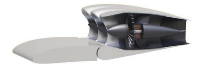
Picture illustrates a cross-section of our ducted fan, embedded in the flap of the jet's wing.

Another area of innovation in our engines is a light pivoting mechanism with custom actuator and variable nozzle coupled to the engine angle. This enables optimal engine efficiency in cruise flight and hover flight.